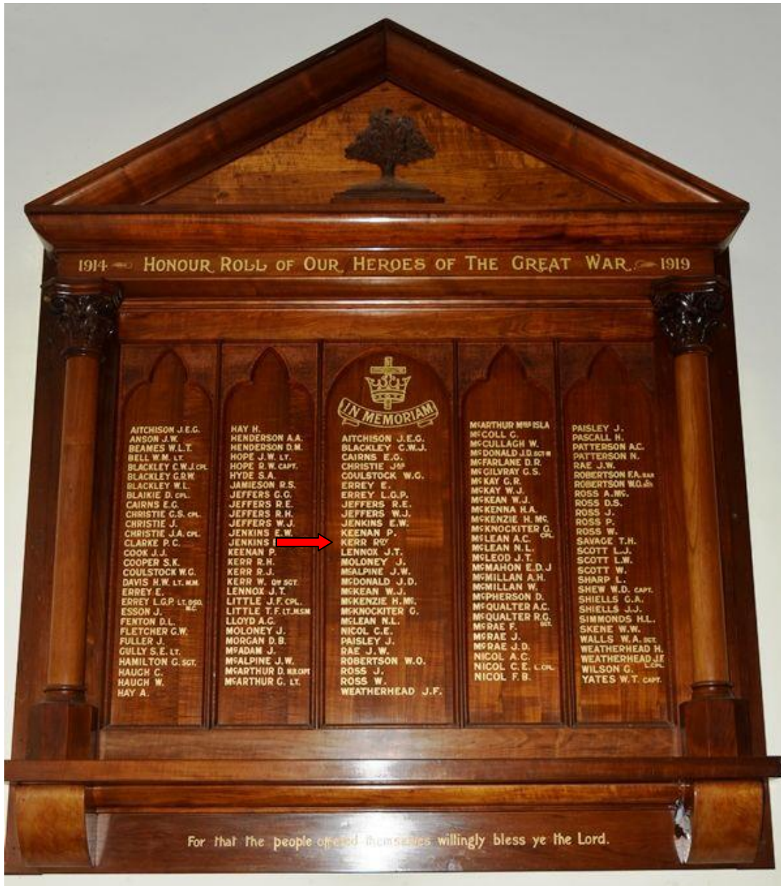
Camperdown Presbyterian Church Honour Roll