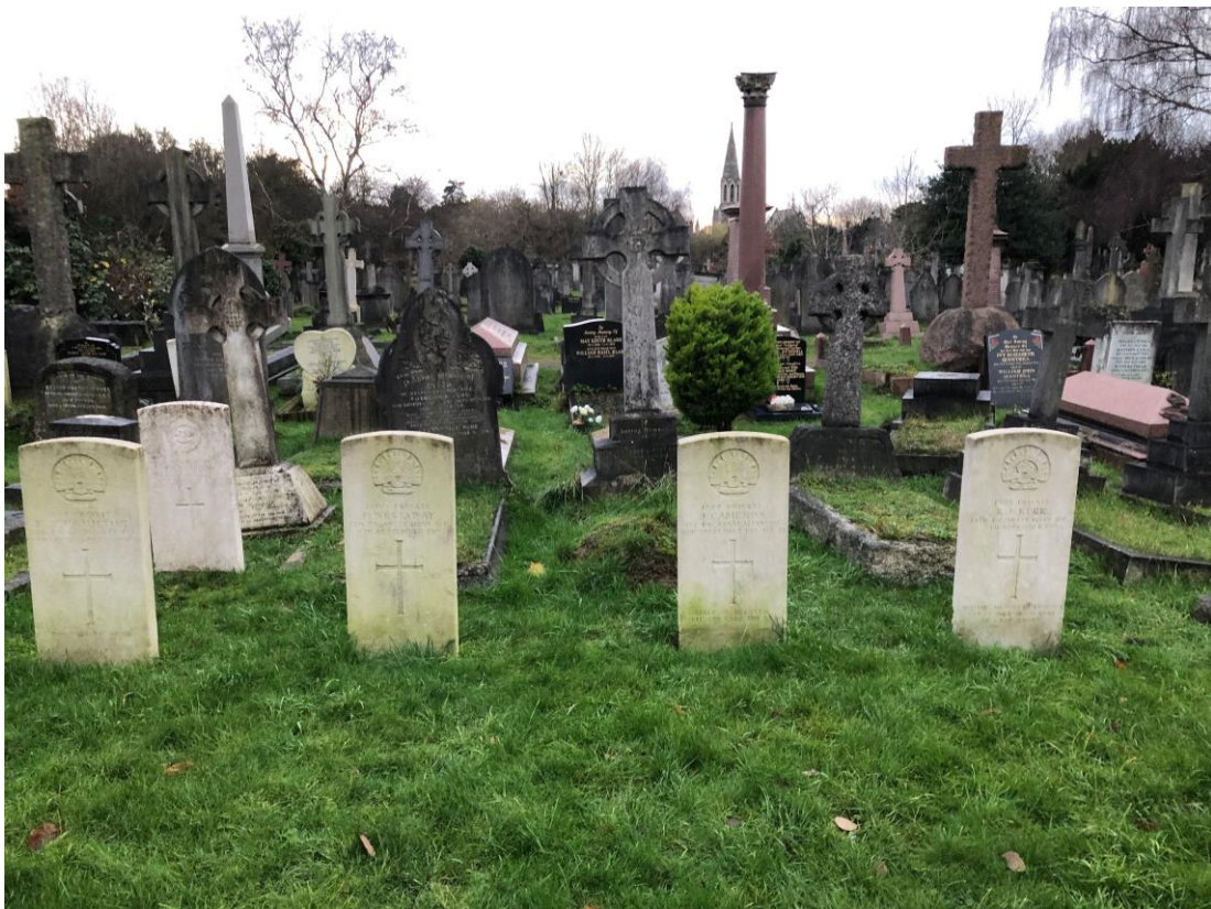
4 Australian WW1 War Graves