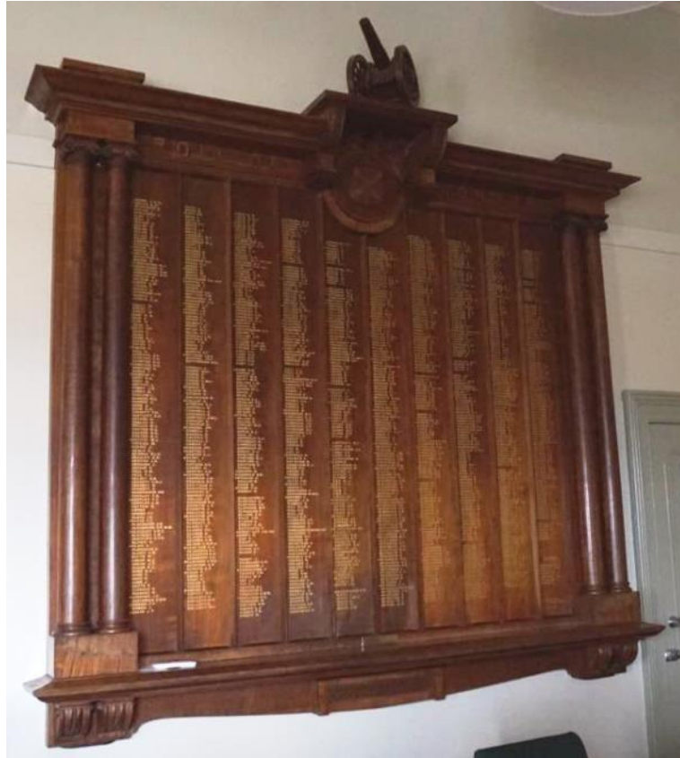
Shire of Hampden Honour Roll