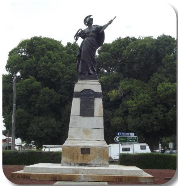
Camperdown War Memorial