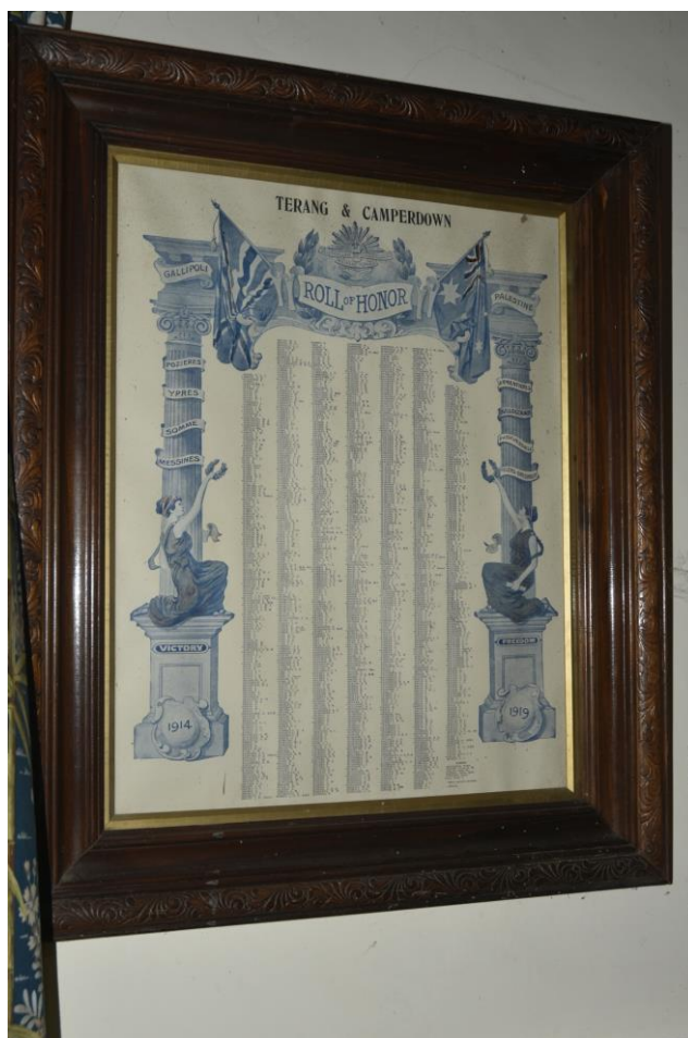
Terang & Camperdown Roll of Honour