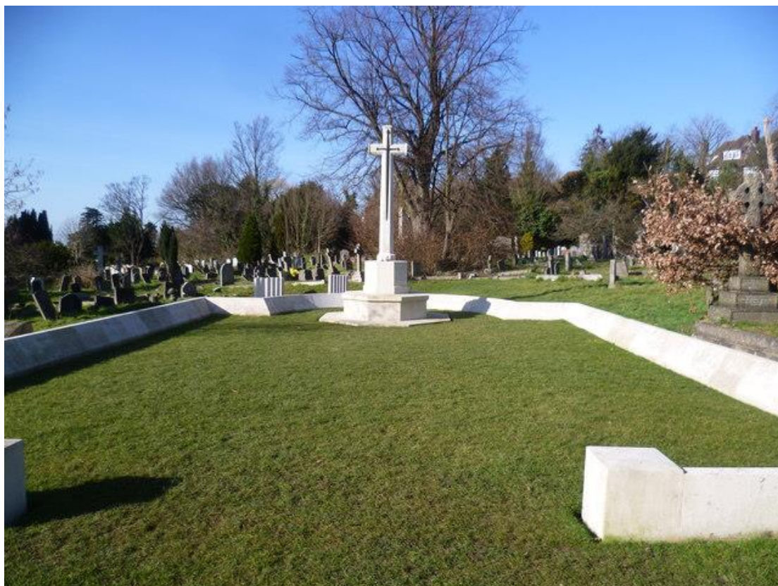
Cross of Sacrifice in Hampstead Cemetery